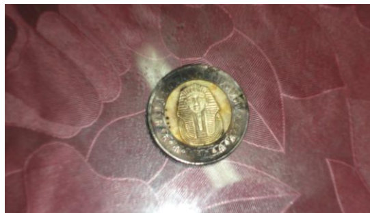
Figure (2): The extracted coin.